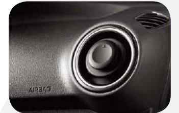
360° rotatable air ducts