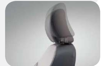
Height adjustable front seat headrest