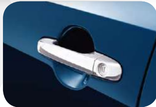
Chrome outside door handles