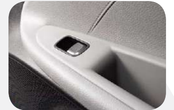
Rear door power windows