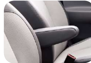
Driver's seat armrest