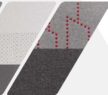
Gray Two-tone Leather