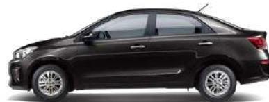
Aurora Black Pearl