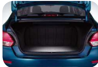
Illuminated luggage compartment (475 L)