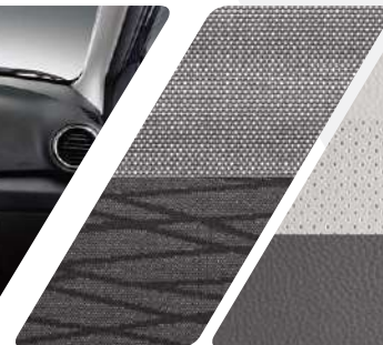
Gray Two-tone Cloth