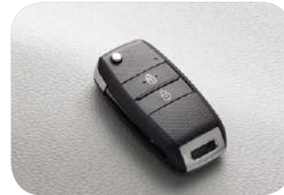
Folding remote key fob