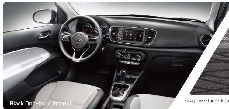
Black One-tone Interior