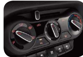
Manual temperature control