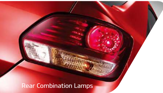
Rear Combination Lamps