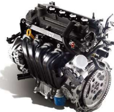
1.4 MPI Gasoline Engine Max. power: 95 ps / 6,000 rpm Max. torque: 13.5 kg-m / 4,000 rpm