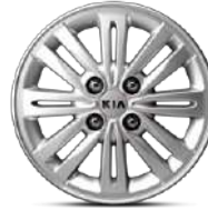
14-inch Alloy Wheel