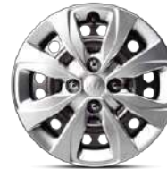
14-inch Steel Wheel