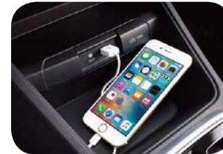
AUX & USB connection with 2-stage tray