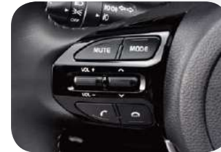
Audio remote control