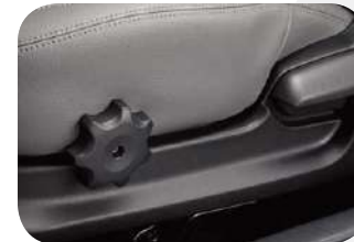
Driver's seat cushion tilt adjuster