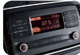
3.8-inch audio display