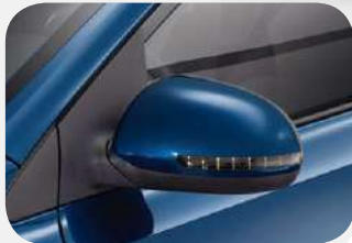
Electric adjustable outside mirrors with LED side repeaters