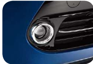
Projection fog lamps