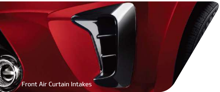
Front Air Curtain Intakes