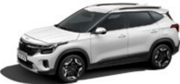
Snow White Pearl (SWP)