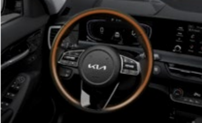
Heated steering wheel