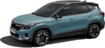
Pluton Blue + Fusion Black (F1A)