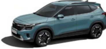
Pluton Blue (PLU)