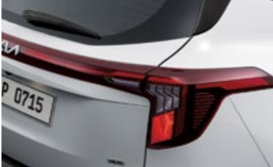
Bulb rear lamps