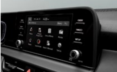
8-inch display audio