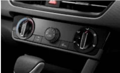
Manual temperature control