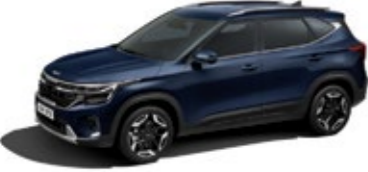
Dark Ocean Blue (BU3)