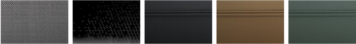
Metal Silver (Injection + Laser embossing) Black High-Gloss (Pad print) Black (Faux stitching) Gentle Brown (Faux stitching) Midnight Green (Faux stitching)