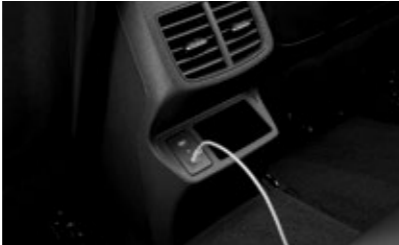
Rear seat USB charger