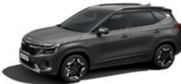
Gravity Gray (KDG)