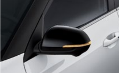
LED outside mirror