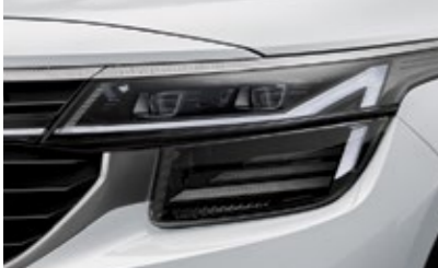
Full LED headlamps

From bold exterior lighting to helpful interior appointments, there are many ways to make the new Seltos your very own.