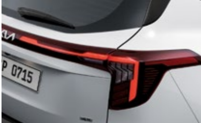
LED rear lamps