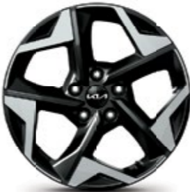
17" Alloy wheel