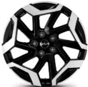
18" Alloy wheel