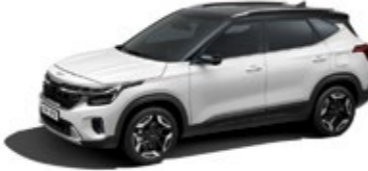
Clear White + Fusion Black (F1D)