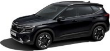
Fusion Black (FSB)