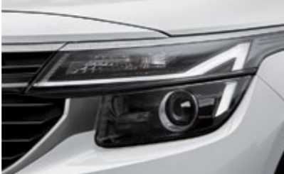
Projection headlamps with LED DRLs