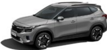
Steel Gray (KLG)