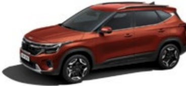
Mars Orange (M3R)