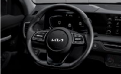
D-cut steering wheel