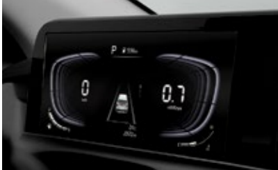
Supervision cluster (4.2-inch color TFT LCD)