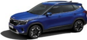
Neptune Blue (B3A)