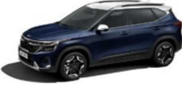
Dark Ocean Blue + Clear White (GA4)