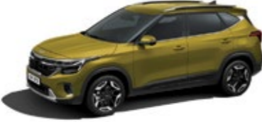
Valais Green (B4E)